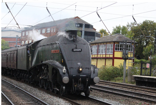
Recent steam past the box. Top: 60009 Union of South Africa on 23 September. Below: 60103 Flying Scotsman on 4 November. Both trains were bound for York. 60103 also passed through on 15 September. Next steam run will hopefully be on 16 December with 46233 Duchess of Sutherland out and 60009 back.

St Albans Signal Box Preservation Trust is a Company limited by guarantee registered in England No. 04333482. Registered office: 9 Kingsway Rd, St Albans, Herts, AL1 3AQ