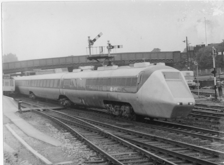
An archive picture taken in 1972/3 showing the Experimental Advance Passenger Train about to pass the 'box on the up fast line. This 4 car gas-turbine powered unit was the fore-runner of the later electric powered service trains that were up to 12 cars long. This unit ran regularly on the Midland Main Line between Derby and Cricklewood and achieved a record 58.5 minutes for the 99.1 miles from Leicester to St Pancras (101.6mph). This compares with the current fastest time of 62 minutes. A record speed of 152.3mph was recorded between Swindon and Reading.