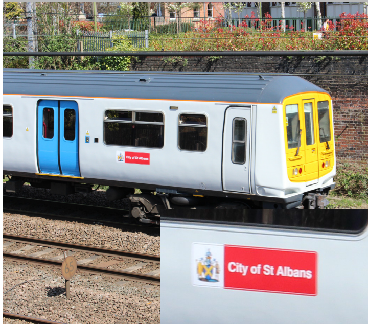
Unit 319 444 'City of St Albans' displaying its new livery and new position for the nameplates whilst departing from City Station on an up working in April.