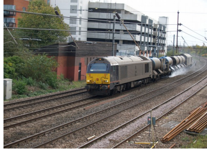
A sure sign that autumn is here; the Rail Head Treatment Train makes one of its 4 times a day trips past the box.