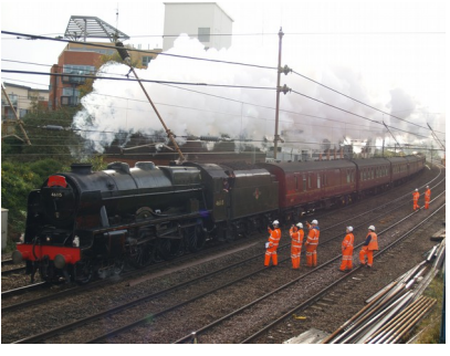
Sunday 9th November 2014, a fine sight past the box!