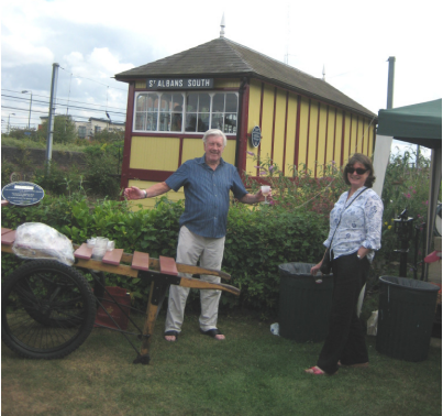
Members enjoying the summer BBQ.