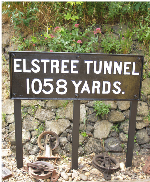
Elstree Museum's generously donated tunnel sign sits outside the 'box' following restoration by Trust members.