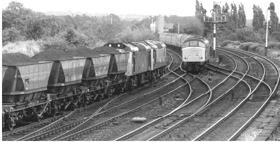
Another archive photograph from Geoff Ryland taken in 1979 looking south from the 'box with trains passing on the slow lines

Ever hopeful! The Railway Touring Company are once again running a trip on 21st December from Victoria to York hauled northbound only by A4 Pacific 60009 Union of South Africa. This train is due to call at St Albans at 8.00am. Not much light at this time so don't blame the Editor if you don't get a good picture. Keep watching the RTC website for updates.