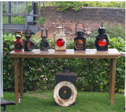
Two more shots from Heritage Open Days. Above: part of the lamp display. Below: a quiet moment to catch up with emails!

The 1915 Midland Railway diagram from the 'box that is now on display courtesy of the Roy Burrows Collection. Note the name of the 'box with the addition of the word 'Junction'.