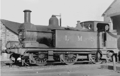
An archive picture donated by a recent visitor to the 'box shows long term St Albans resident Johnson 1F 0-6-0T 1854 in LMS days standing in the shed yard.