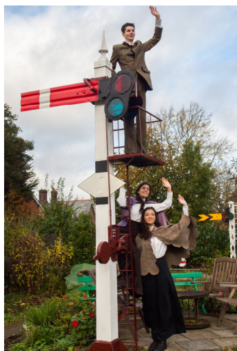
Below: the new Midland lower quadrant signal provides an excellent 'prop' for the three principals to stand on and wave to the trains!