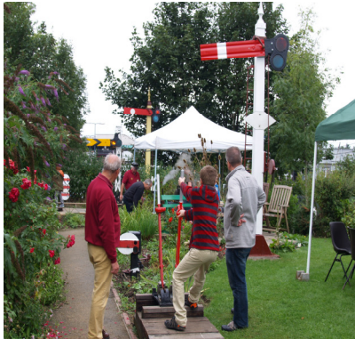
'HOD' visitors in action.