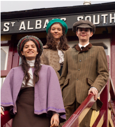
Above: the three Railway Children pose on the 'box steps.