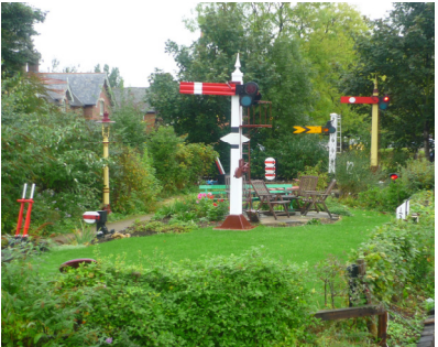
The new Midland signal stands in the middle of the garden.

After a poor start to the year the Summer weather was excellent, and good progress has been made. In pride of place, our new lower quadrant Midland signal on the lawn was completed in time for Heritage Open Weekend. Operated from the LNWR ground frame by the path, it has proved very popular with visitors and now has the addition of a platform to enable the paraffin lamp to be inserted. The post was from the NRM and the parts from the Roy Burrows Collection. Furthermore, all our signals now have access ladders, thanks to some nifty metalwork by Jim Macdonald.