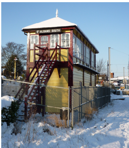
Winter returned with a vengeance recently but still the 'box stood out against the snowy surrounds.