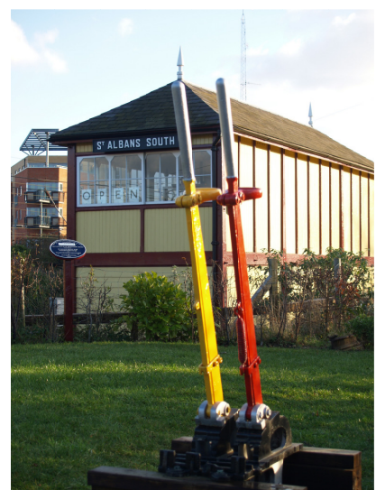
The L&NWR ground frame in the garden now operating the MR ground signal.