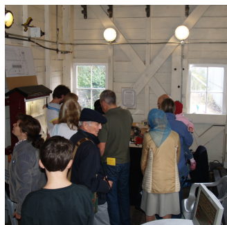
Open Weekend visitors crowded into the museum room to look at the exhibits and the steam model railway