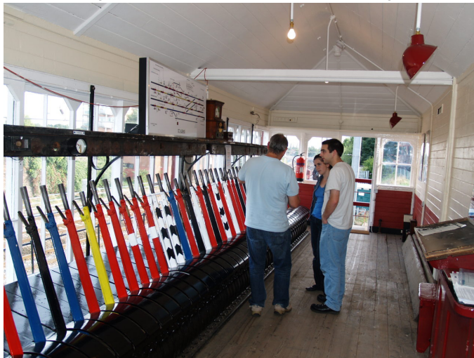
The lever frame looking superb during the Heritage Open Weekend in September

St Albans Signal Box Preservation Trust www.sigbox.co.uk