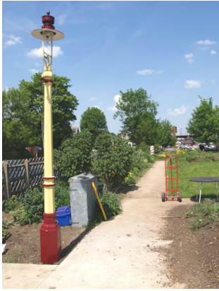
The Midland Railway lamp post that originally stood in the old St Albans station forecourt