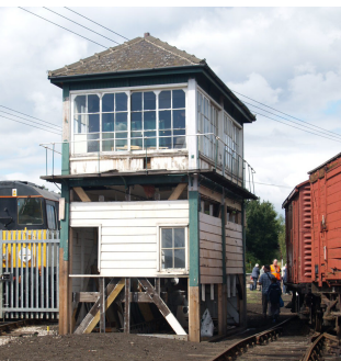
Another ex-Midland Railway signal box in course of restoration! This one is at Barrow Hill Roundhouse, dates from 1897 and was originally at Pinxton.