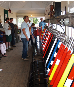
A visitor tries his hand at the lever frame!