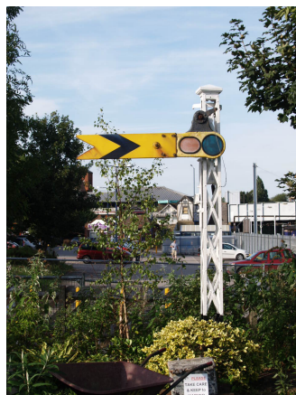
The donated distant signal sited in the garden