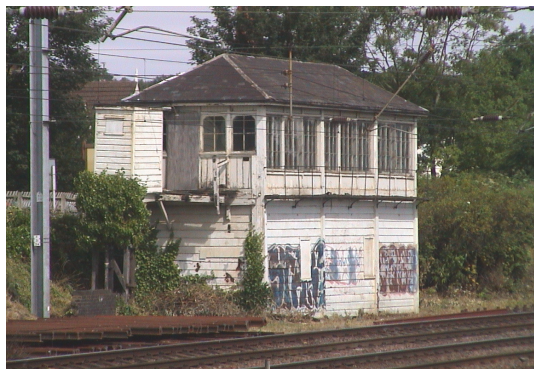
St Albans South Signal Box in 2002