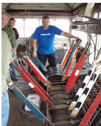
Top: the reproduction lamp hut