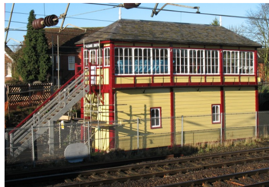
St Albans South Signal Box in 2008

Each time that I see the box I am amazed at the progress that has been made especially in the last twelve months. It is hard now to remember exactly how awful the box looked in the days before the Trust was set up. The pictures above however give a clear indication of the transformation that has taken place whilst overleaf are similar 'then and now' pictures of the garden area. I can't wait to see the inside of the box fully painted, equipped and looking like a 1950s busy signal box.