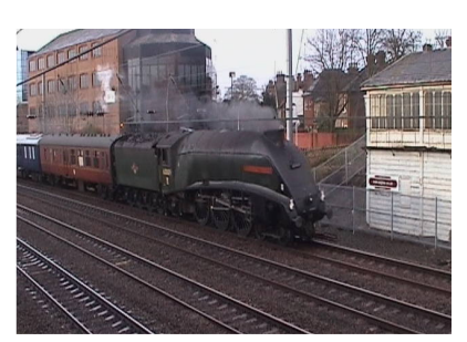
Don't see many of those thundering past!