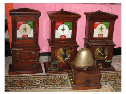
Some instruments to demonstrate