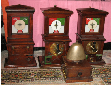
Some instruments to demonstrate