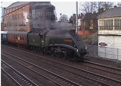
Don't see many of those thundering past!