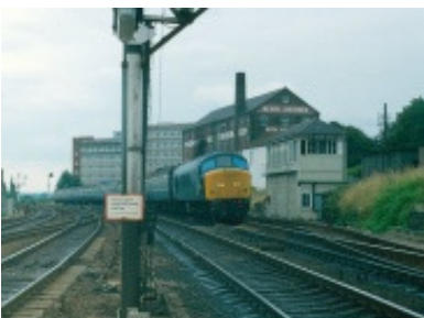
The box in 1978. Heath and Heather building too!

The Architectural Heritage Fund is continuing to support the project with its project administration grants. This steady income is becoming more useful as the project gets underway.