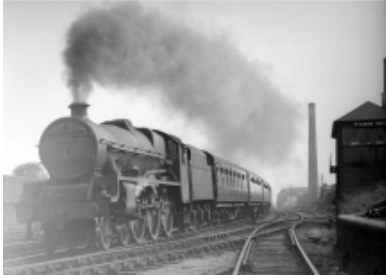
The earliest photo we have found - 1930's?