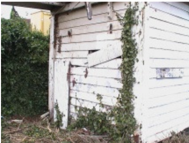
Jan 2005 - It's getting in a state!